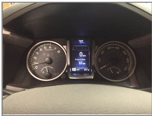
No MIL Illuminated

Considering the fact that a capable scan tool is the only way to identify some DTCs, Toyota requires that repairers perform a “Health Check” diagnostic scan if a vehicle has sustained damage as a result of a collision that may affect electrical systems. Additionally, Toyota strongly recommends that repairers perform a “Health Check” diagnostic scan before and after every repair to identify and document DTCs. If DTCs are identified pre-repair, then they can be considered to create a complete vehicle damage analysis report. If DTCs are identified post-repair, then they can be diagnosed and addressed before returning a vehicle to the customer.